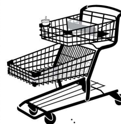
FOOD STYLING: KAREN EVANS; ILLUSTRATIONS: BRUNOILLO

Wegmans supermarkets roll out new, more spacious carts that, like Goldman's original, have two separate storage sections, plus a cup holder, a two-kid seat, and handlebars treated with germ-resistant coating.